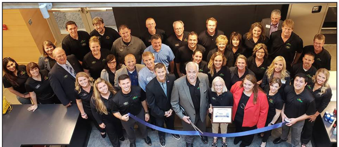
Sioux Falls Chamber Ribbon cutting on September 18, 2018.

"It was my idea to construct a building very similar to our Watertown North building with historic timber frame rafters and tumbled brick to establish the Reliabank "look." My sons would not hear of it. Continued on p.2