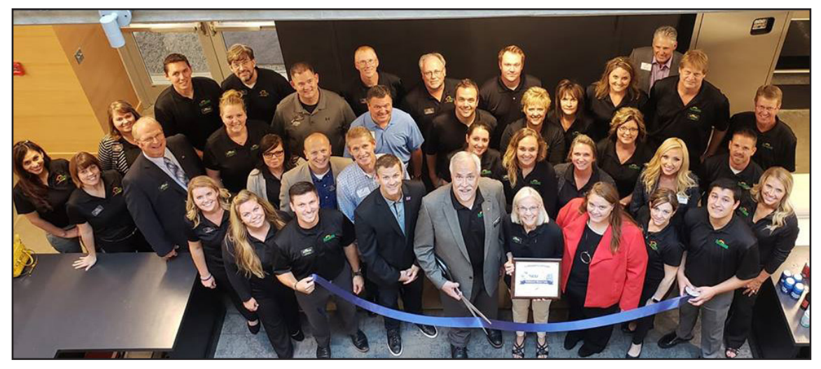
Sioux Falls Chamber Ribbon cutting on September 18, 2018.

"It was my idea to construct a building very similar to our Watertown North building with historic timber frame rafters and tumbled brick to establish the Reliabank "look." My sons would not hear of it. Continued on p.2